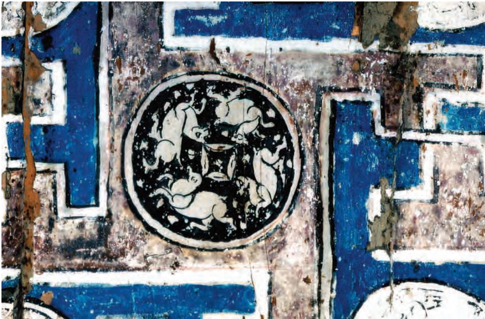
Detail of the four hares, Alchi, Leh district, Ladakh c1220AD

The repeat occurrence of the swastika is important as it relates to the very real geography. Bon practitioners, the pre-Buddhist believers call Mount Kailash, the nine-story Swastika Mountain and regard it as the seat of all spiritual power. In the Zoroastrian religion of Persia, the swastika was a symbol of the revolving sun, infinity, or continuing creation. Kailash is seen as the centre of the world and the four rivers as arms of the Swastika.