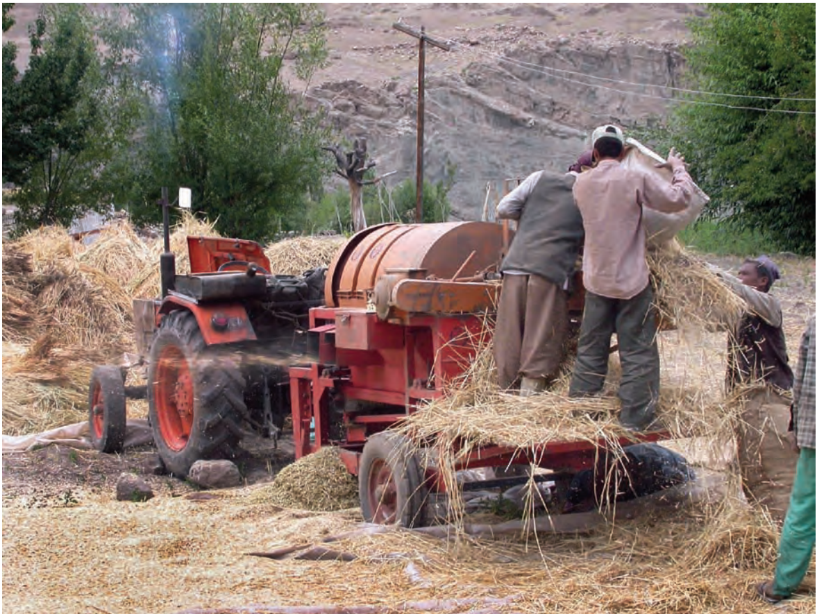
Harvest, Alchi, Leh district of Jammu and Kashmir, India

So in Ladakh there is to this day an unbroken chain of monasteries and learning that connects them right back through Alchi to Kashmir, which was at that time Buddhist. Kashmir was itself connected back to the world of Gandhara, Afghanistan and Swat. But after these monasteries in Kashmir were destroyed or became redundant, these later smaller teaching monasteries, set deep in the mountains of Ladakh, became very important and were like jewels in a chain leading towards Tibet. It was through Ladakh that the Buddhist teachings finally reached Tibet for the second time. So the importance of these temples cannot be overstated.