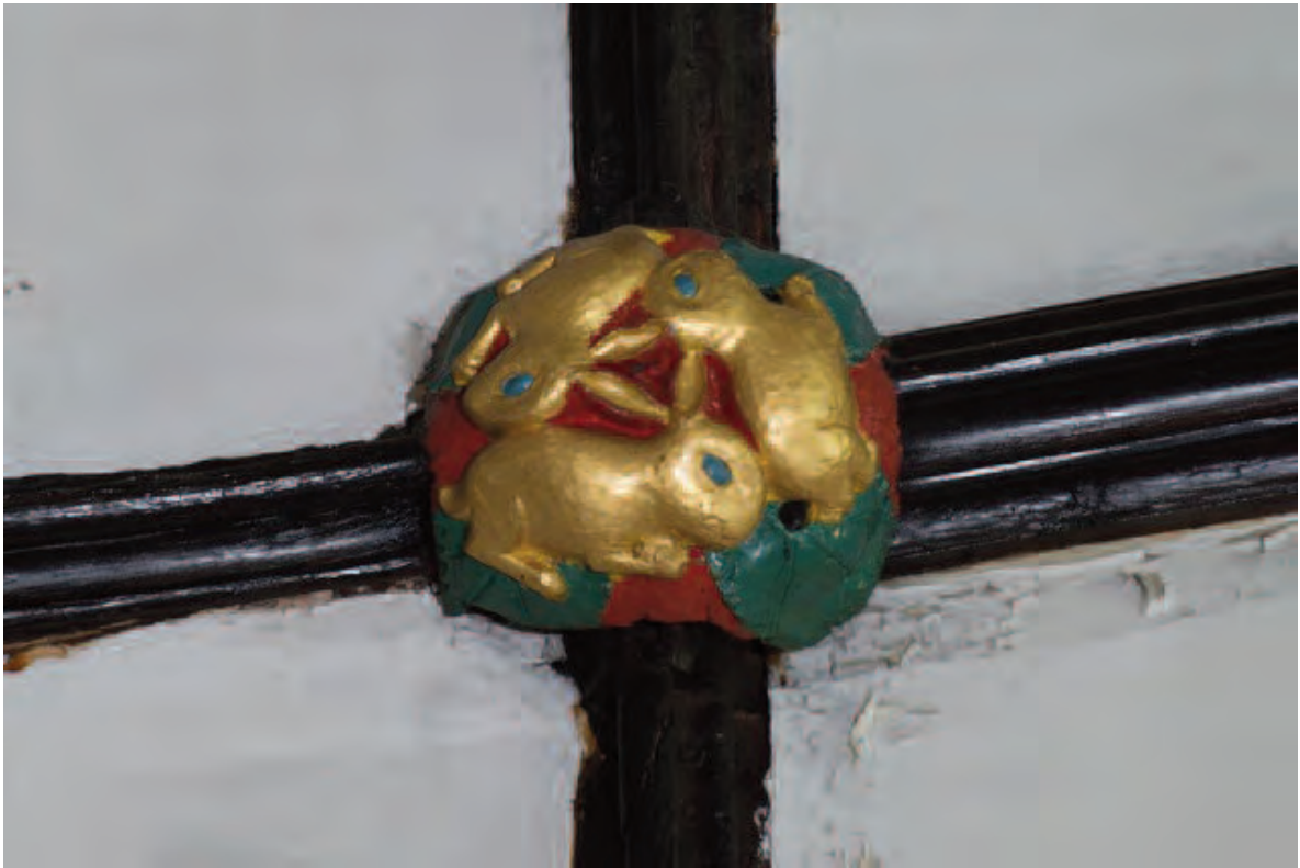
Three Hares roof boss, Tavistock, Devon.

For nearly two thousand years there flowed along this tenuous, lengthy and even fragile route, an extraordinarily rich trade, not only of dried goods and fruits, silks and carpets, dyes and textiles, perfumes, gold, silver and tea, apothecaries herbs and drugs, but also ideas, philosophies and religious concepts, as well as folklore and superstition. It is along this route that the Three Hares symbol must have travelled, possibly in both directions and at different times. It was an important corridor, as important as the worldwide web is today. Yet with all our technology and scientific understanding, we still do not know the true meaning of the symbol, not least because it occurs in many different cultures in many different settings.