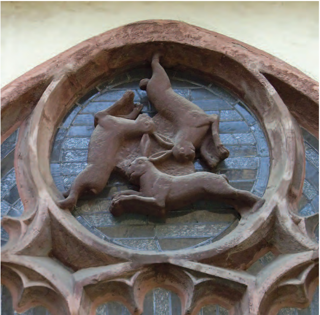
Dreihasenfenster – 'Window of Three Hares' – in the inner courtyard of the cloister, Paderborn Cathedral, Germany, 16th century.

In his book Archetypes and the Collective Unconscious Jung mentions the Three Hares window in Paderborn cathedral, which he says represents consciousness "scenting or intuiting" the unconscious and the centre of one's self. In other words for him the Trinity is the archetype of the universal Self. There are also unconscious links to ancient forms of the triple deity. In Jung's own words: 'Triads of gods appear very early, at the primitive level'. The Three Hares are therefore much older and more important psychologically than we realise, not only to early religions but to a sense of personal unity and completeness. Fluidity in balance.