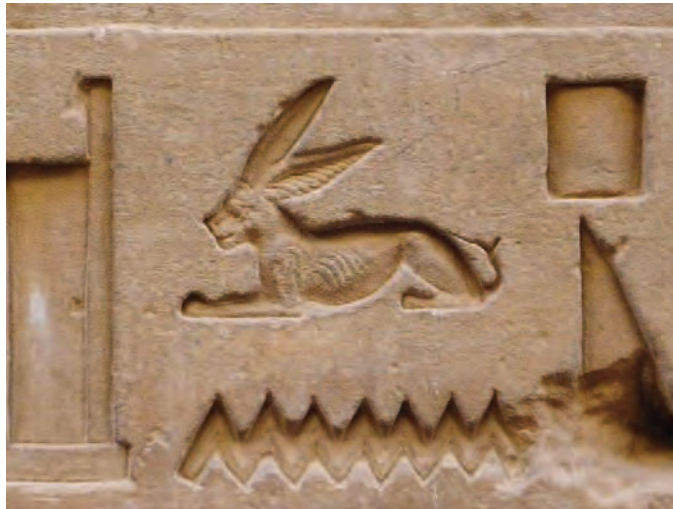
Stony faced Egyptian hare. To be or not to be...a hare surfing on the River Nile Wall relief of a hare, temple of Edfu, Egypt.

Osiris was therefore often depicted in the shape of a hare before being torn to pieces and thrown into the Nile to ensure the seasonal cycle of renewal. So the hare, the Nile, fertility and agriculture were one and the same. Bit like hare coursing. Poor hares always get it in the neck.