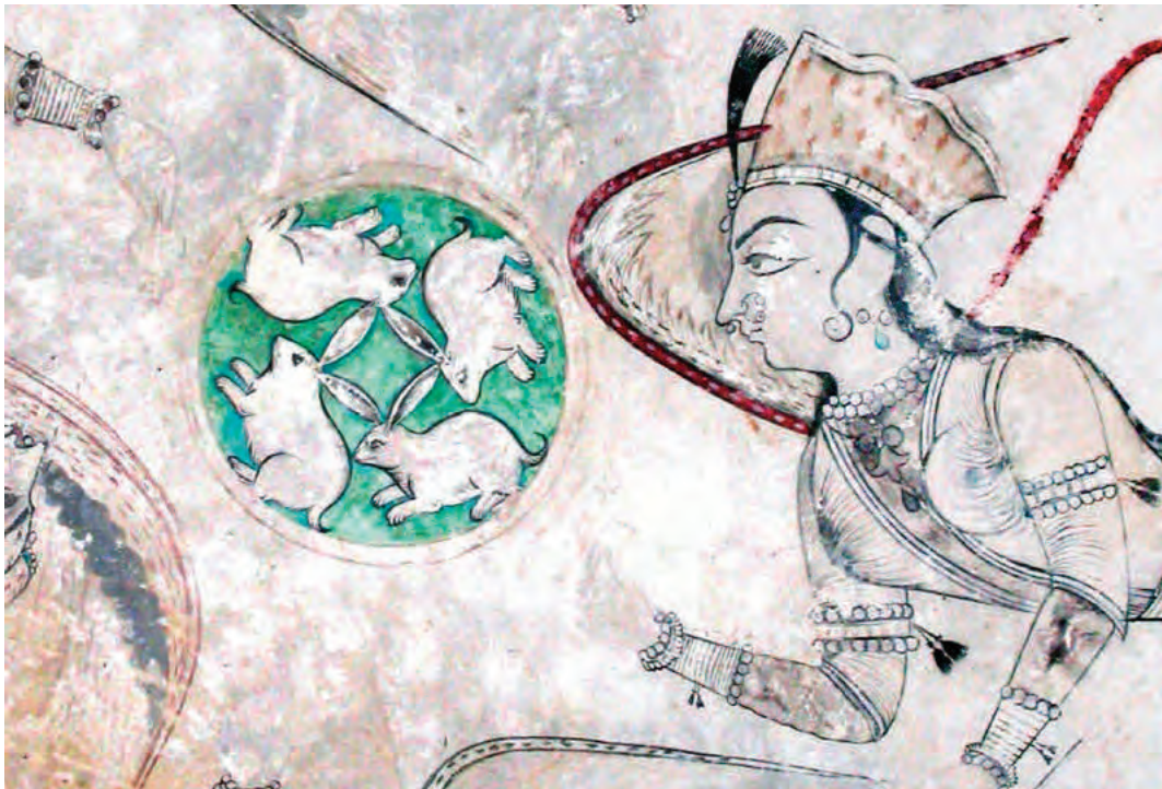
Four Hares and Apsaras, Hadi Rani Mahal Loggia, Nagaur, Rajasthan, c1750 Photo: Carol Trewin 2005

The Apsaras were female spirits of the clouds and waters in Hindu and Buddhist mythology: beautiful, supernatural female beings, youthful, elegant and superb in the art of dancing. 39 There is a very appealing description which defies the notion that the supposedly innocent rabbits and apsaras look as if butter wouldn't melt in their mouths. According to the Mahabaratta the apsaras are possessed of 'eyes like lotus leaves and are employed in enticing the hearts of persons practicing rigid austerities. They have slim waists and fair large hips, and when they dance they begin to perform various evolutions, shaking their deep bosoms, and casting their glances around, and exhibiting other attractive attitudes capable of stealing the hearts and resolutions and minds of the spectators.'