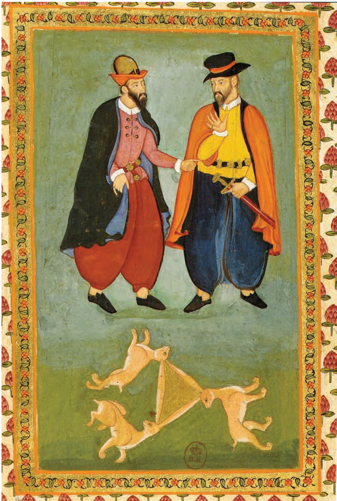
'Two Portuguese in conversation,' gouache on paper with a floral Moghul border, c1580, artist unknown.