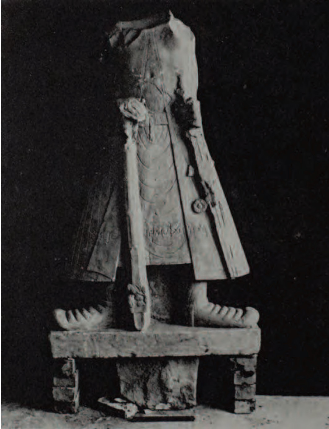
Statue of the Kushan Emperor Kanishka 2nd century AD, Mathura, Uttar Pradesh, North India

These elegant artistic styles persisted for many centuries and many Gandharan statues can be seen in museums around the world.