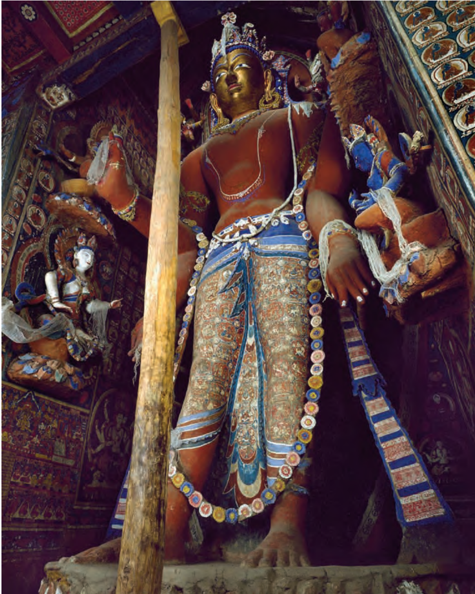
Statue of Maitreya, Sumtsek temple, Alchi c1200AD