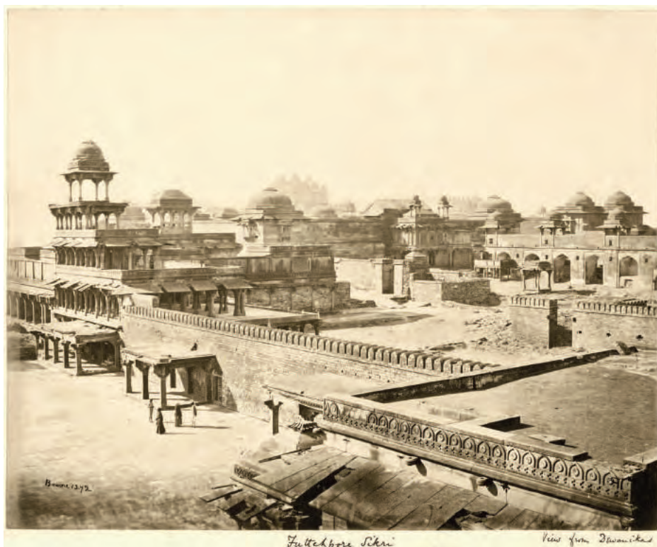
Fatehpur Sikri, Agra, Uttar Pradesh, India, 1870 34