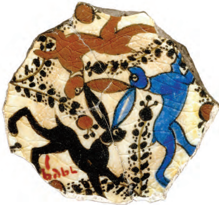
Egyptian or Syrian pottery fragment c1200AD Cairo Museum

T HE PATH OF THE HARE IS NEVER SIMPLE. It is erratic, complex and much more ancient than people realise. By its very nature the quest is open ended with many unanswered questions. There are several different meanings to the Three Hares symbol, some of which may well have been lost over the course of time, others are conjecture, common sense and folklore. It is after all a symbol, and symbols can mean very different things to different people at different times in different cultures. The Three Hares are flexible and in motion, never staying still and that is the key to its success and long life. To some it is the Trinity, to others it is the Three Jewels of Buddhist teaching. It can be past, present and future; Vitality, Rebirth and Resurrection.