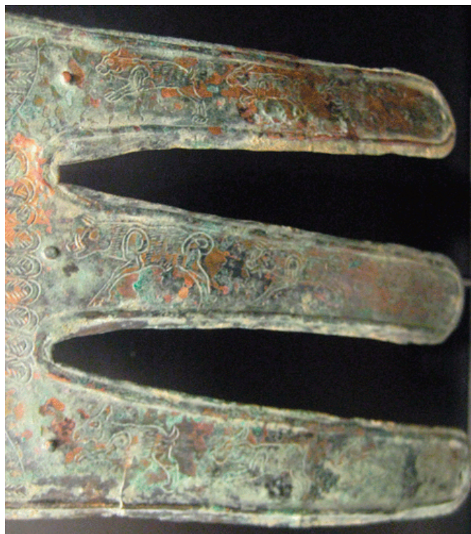
Top: Three Urartu/Armenian Hares c800BC

Three wild boars, three hares and three mythical birds. There is a border of what looks like the edge of a field of wheat so this may well be linked to the transition to early agriculture where hares and other animals seek shelter in the field.