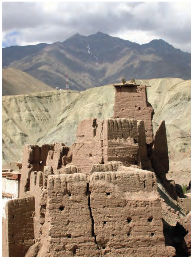
Basgo Fortress, Ladakh.

F IFTEEN MILES BACK ON THE ROAD FROM ALCHI towards Leh is the ancient but decaying mud bricked Royal fortress of Basgo within which lies the Maitreya temple with the four hares. Basgo was an ancient trading place and was the capital of Ladakh in ancient times long before Leh was chosen. The temples were built in the 16th and 17th centuries AD and the fortress was very lucky to survive a siege of three years in 1680–1683, when the fifth Dalai Lama went on the warpath.