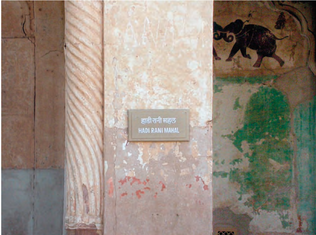
Entrance to Hadi Rani Mahal, Nagaur, Rajasthan showing elephants fighting, (top right).

The murals, although in need of conservation, are among the finest examples of Rajput-Mughal art in Rajasthan. The wall paintings are breathtaking and display many scenes from courtly life within the women's quarters and thus provide an intimate portrait of royal life in Nagaur in the 18th century.