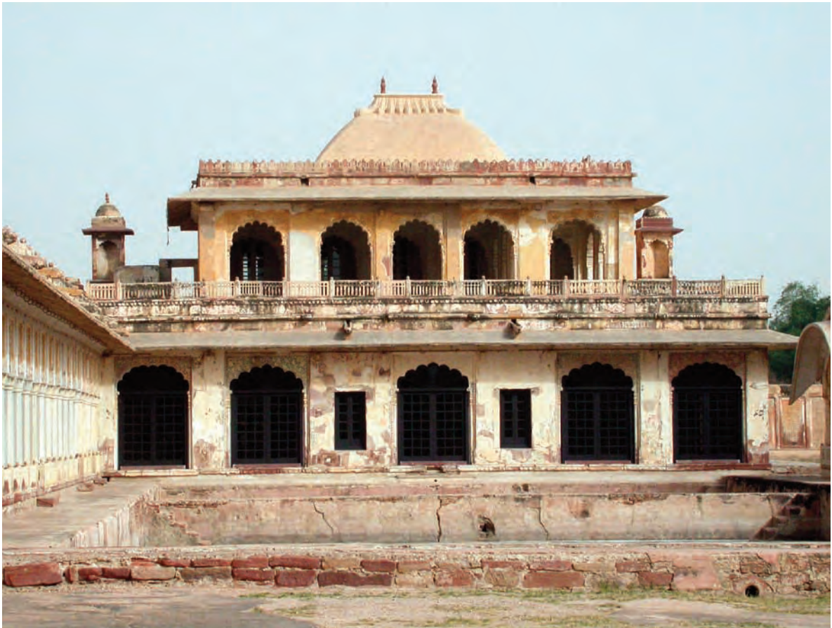
Abha Mahal, Nagaur, Rajasthan.

INSIDE THIS PALACE lies the second hare/rabbit roundel. In the foreground is the Queen's swimming pool. The Abha Mahal has since been restored. The colonnade on the left connects to the Queen's palace, the Hadi Rani Mahal. So the rabbits are in prime royal locations. Some of the finest Rajput/Moghul murals in all of Marwar. 40