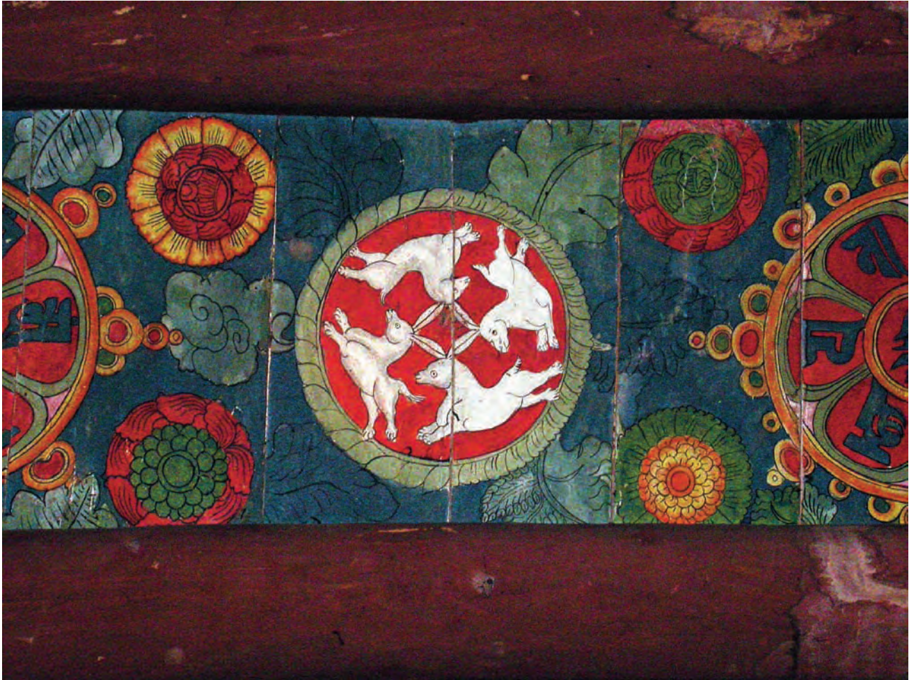
Four hares on the ceiling of the Basgo Maitreya Temple c1550AD

In Basgo the Chamba Lakhang and Serzang temples are in the centre of the castle complex and are dedicated to the Maitreya Buddha, the fifth incarnation of Sakyamuni. 24 The temple walls are covered with murals depicting vignettes from the life of Buddha and portraits of the benefactors. The largest of the three structures holds a forty-five foot statue of the Maitreya Buddha.