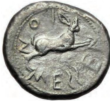
Sicily, Messina, Tetradrachm, c480–470BC; Bertolami Fine Arts – ACR Auctions > E-Auction 32