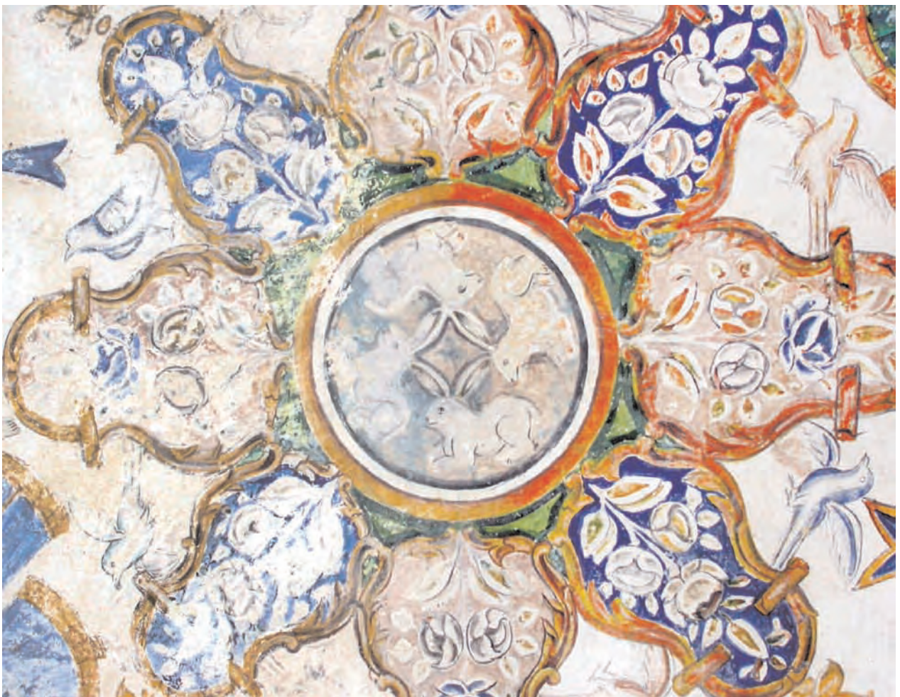
Four Hares, Abha Mahal, Nagaur, Rajasthan, c1850