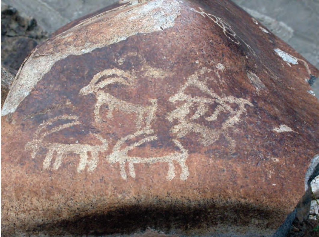
Ibex Carvings on the banks of the River Indus.

Today Alchi is a quiet backwater forty miles west of Leh and is under the supervision of Likir Monastery. 13 In the old trading days, which only ceased in 1947, it was eight days from Leh for a caravan of yaks and ponies to reach Kargil and Alchi is about midway. Alchi must have always been an important site as there are also many stone carved petroglyphs of men hunting ibex which are several thousand years old; these can be seen on large boulders dotted along the river bank, as well as graffiti from early Tibetan soldiers.