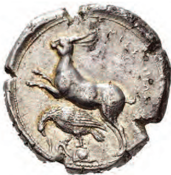
Greek tetradrachm of a hare leaping over an eagle which is having a tussle with a serpent c420BC

The transition from a single hare to three hares first in a line and then in a circle is key to this debate. Hares are also seen on coins with hunting eagles, doves, dolphins and even crabs.