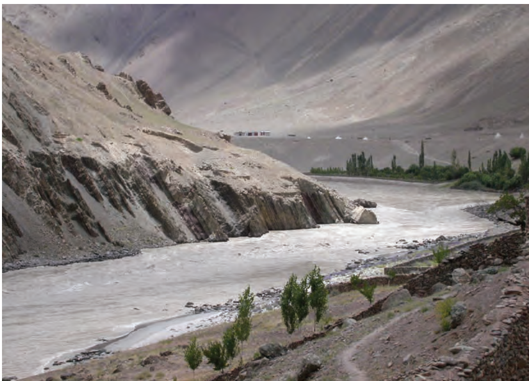
River Indus at Alchi.

Alchi is a small but ancient monastic complex in a rural setting amidst fields of wheat and barley surrounded by poplars and apricot trees. Alchi is also that rare thing a special monastery where translations, transmission and advanced teaching took place: a place of retreat and initiation, and a powerhouse of knowledge and Buddhist philosophy. Such sites are not just monasteries – in Tibetan they are known as chos'khor 11 which literally means 'Dharma wheel' ie places where the wheel of the Buddha's teaching always turns. The wheel of doctrine. Not to be confused with the mani wheels which also turn and spread blessings.