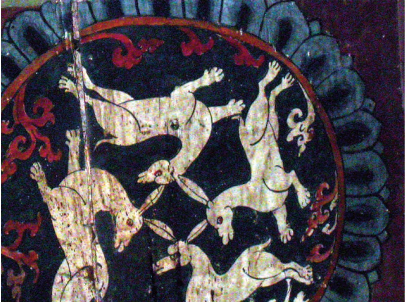
Four Hares, Basgo c1550AD. (White on red & black in a lotus surround with what looks like flames almost reminiscent of the Swat Three Hares)