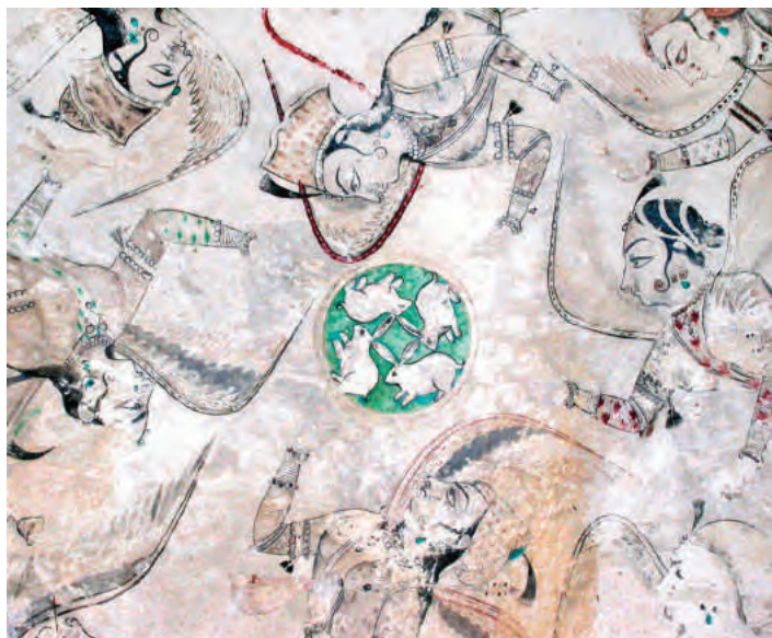
Four hares and Apsaras, Hadi Rani Mahal Loggia, Nagaur, Rajasthan, c1750

T HE RABBITS/HARES ARE FOUR IN NUMBER and painted as a central roundel on the ceiling of the loggia and are surrounded by apsaras with angel wings. These apsaras are more Sasanian and Persian in origin than Indian, though they do occur in both Dunhuang and in Alchi. Apsaras are a common theme and can be houris or angels depending on where you come from. Here they are beautiful, gyrating and voluptuous dancing girls with tassels, bangles and bells; strong women with attitude – just right for a Maharajah. The four hares/rabbits are also gyrating clockwise and have a rather bemused expression on their faces, as if they know something we don't. They may well be connected to festivals held on the full moon. Maharajahs got up to all sorts of things on the full moon which left little to the imagination. 37 Such is the heat of the desert nights.