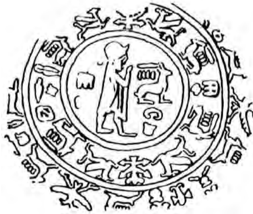
Hittite hare seal with eagles – Ugarit seal, C.1800BC

There are also Bronze Age Hittite hares from Syria running round in circles with double headed eagles. One stamp seal from the port city of Ugarit, now known as Ras Shamra, on the Mediterranean coast, (c.1800BC) has a hare in the centre alongside a man with a large helmet, then a ring of four hares and an outer ring of eight hares with other animals and birds interspersed. 1