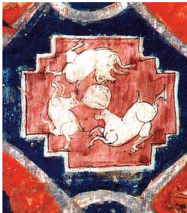
Detail of the Three Hares, Sumtsek temple, Alchi