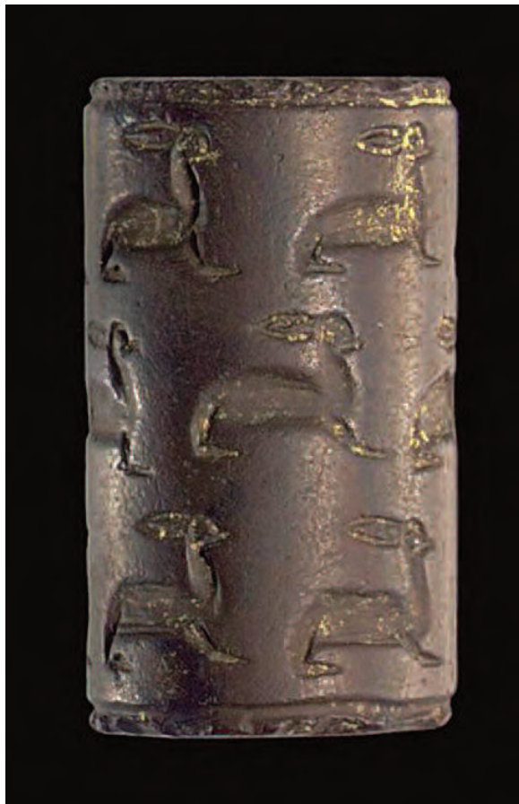
A Syrian Cylinder Seal, circa mid nineteenth-century BC from Christies

There is also a spectacular haematite cylinder seal with multiple hares on it which came up for sale at Christies recently. c1850BC