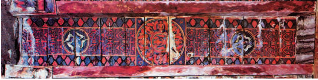
White Temple, Tsaparang, Guge, Western Tibet (Ngari Prefecture).

So in Ladakh there is to this day an unbroken chain of monasteries and learning that connects them right back through Alchi to Kashmir, which was at that time Buddhist. Kashmir was itself connected back to the world of Gandhara, Afghanistan and Swat. But after these monasteries in Kashmir were destroyed or became redundant, these later smaller teaching monasteries, set deep in the mountains of Ladakh, became very important and were like jewels in a chain leading towards Tibet. It was through Ladakh that the Buddhist teachings finally reached Tibet for the second time. So the importance of these temples cannot be overstated.