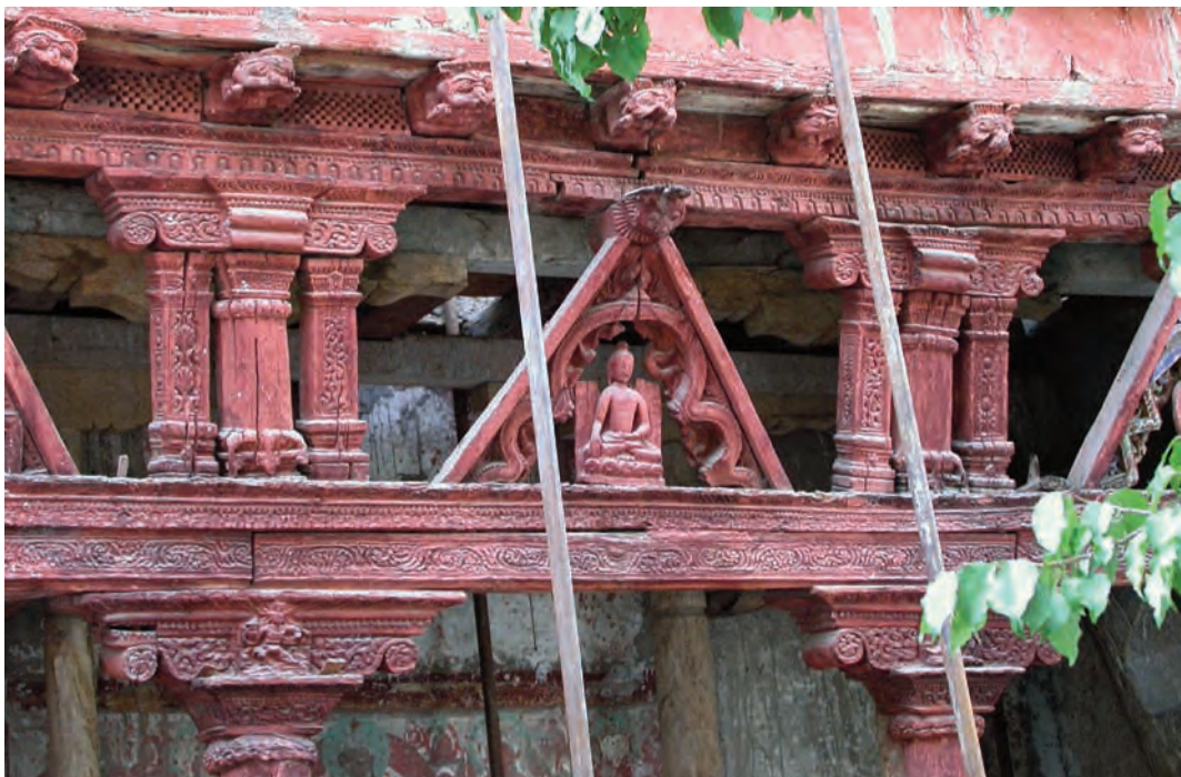
The Sumtsek temple entrance, showing intricate wood carving in Kashmiri style, c1200AD.

At Alchi the outside façade of the Sumtsek temple is wooden and is leaning outwards at a rather alarming angle. On the façade there are many ornate carvings and some of the small pillars on the upper storey have Greek style capitals 'Ionian' carved in wood and triangular 'A' frames with carved figures in the niches. To gain entrance to the temple one has to go through a very low doorway and it is very dark indeed.