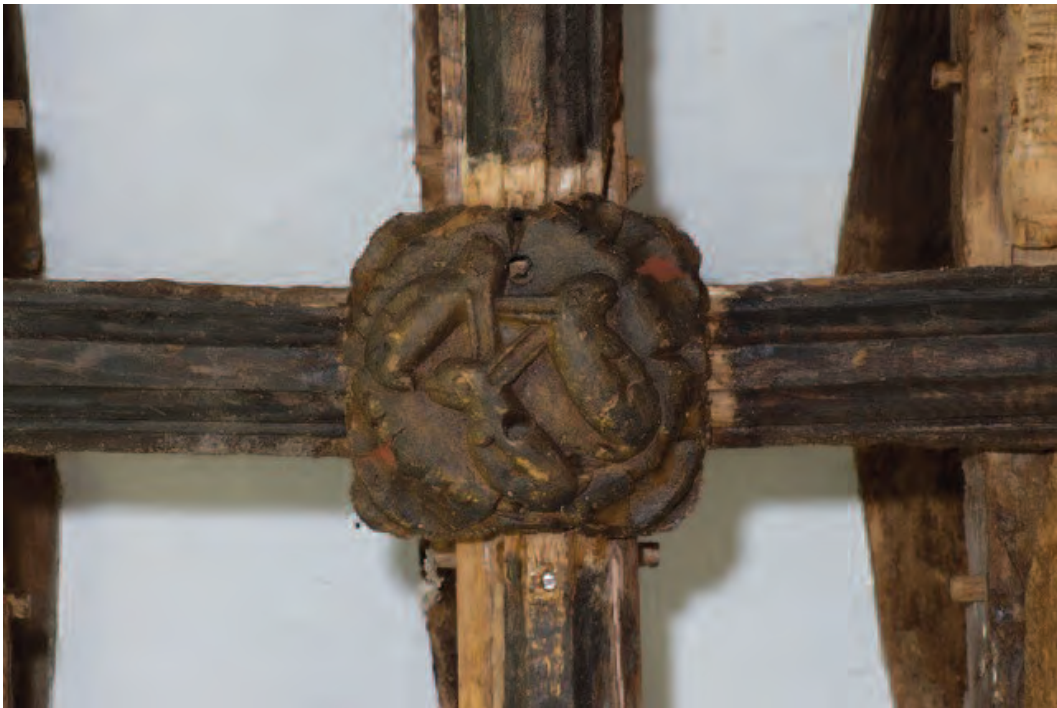
Three hares inside Kelly Church, West Devon c.1500