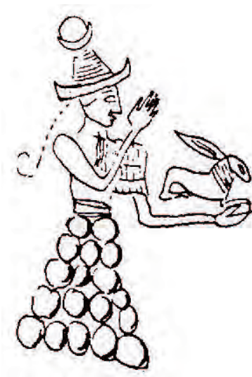
Hittite Moon Priest Ring Seal c1600BC.

These are multiple hares and seem to be concerned with a specific person's identity or property and are everyday objects. Also there is a possible religious link between the moon and the hare and a priest as this Hittite seal impression shows. (Origin and provenance unknown.)