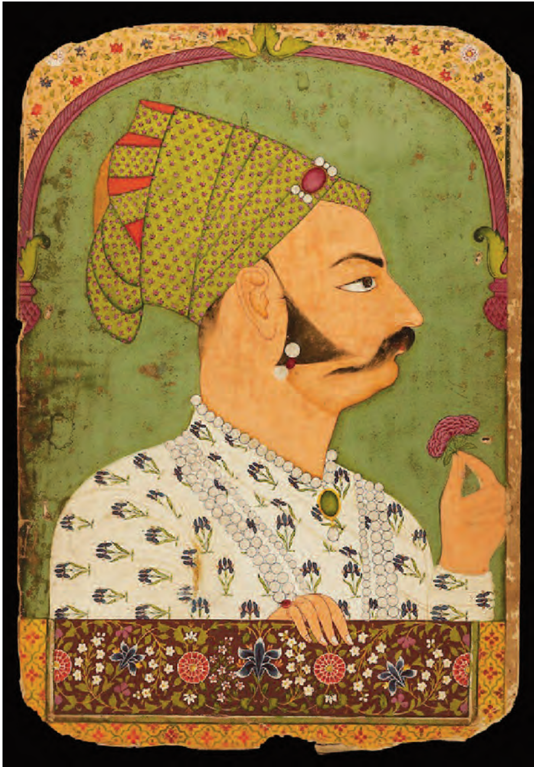
LI118.36 Portrait of Bakhat Singh, Maharaja of Jodhpur. On loan from Howard Hodgkin.

over twenty-five years he hired some of the best painters in the land. They may have sought refuge after the sack of Delhi by Nadir Shah in 1739. 36