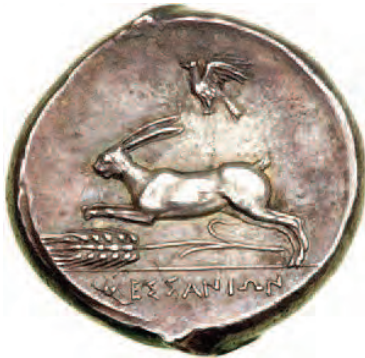
Hare with ear of barley and eagle hovering, Sicily, Messina, Silver Tetradrachm, c420BC

http://www.coinarchives.com/a/results.php?results=100&search=mule