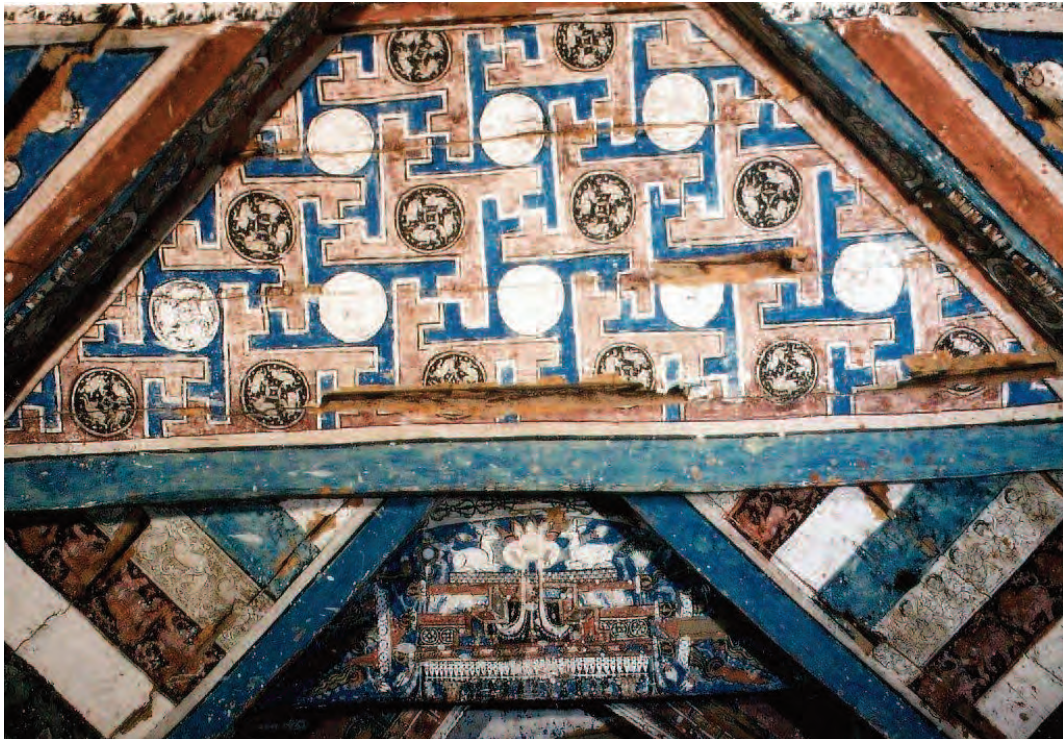
Inside the Great Stupa at Alchi. The swastika is clearly seen as are the three and four hare motifs as well as the two Sarnath deer and surrounding vajra motif below. c1220AD

T HE SUMTSEK IS NOT THE ONLY TEMPLE AT ALCHI. It is part of a much larger monastic complex surrounded by a wall and it is inside the Great Chorten or Stupa that three and four hares can also be seen. They are connected by what looks to be a kind of Greek key pattern which has the swastika as its central repeating pattern. In other words the four rivers are flowing from Mount Kailash in Tibet. So the Indus is symbolically connected to Mount Kailash, Shiva's mountain. When on pilgrimage The Tibetans go round Kailash clockwise, the Bon anticlockwise. 23