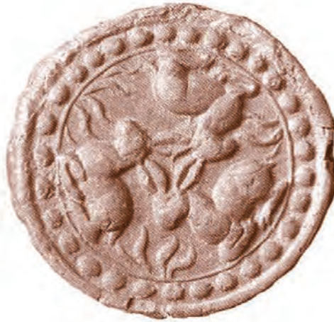
Terracotta plaque from Bari Kot, Swat, N.W. Pakistan, 9th-10th centuries AD, Shahi period. Size 8cm diameter. Source: Swat Museum Saidu Sharif, NW Pakistan

The terracotta plaque was found in what might well be described as a small fire temple. Fire ritual was common in Iran and the Shahi period 8 , linked with Kabul and Kapisa. The Shahi period whose Kings succeeded the Kushanas ruled over much of what was Gandhara. The terracotta seal is probably from the end of the Buddhist Kabul Shahi period. Both Buddhists and Hindus lived alongside each other for over five hundred years. The early Buddhist kings may even have been Tibetan. At that time Ladakh also controlled much of what is now Western Tibet.