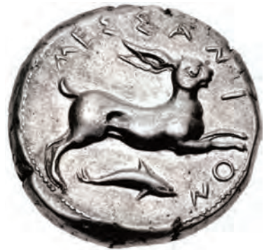
Hare with Dolphin Sicily, Messina Silver Tetradrachm c420–413BC

So there is a distinct continuity in the use of hares on ceremonial objects in the Middle East over several thousand years. Historically the hare is therefore very important, fecund with meaning and worthy of investigation.