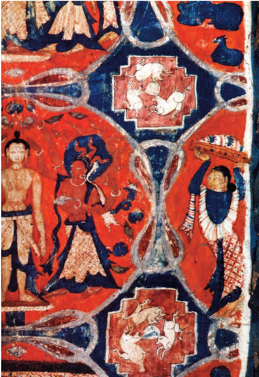
Detail of Three hares and a figure of eight pattern that is like a primitive vajra, Sumtsek temple, Alchi

The thunderbolt is a Tibetan ritual weapon used in puja or evocations of certain deities. The vajra may also apply to the teaching which is called Vajrayana, or Tantric Buddhism which was very popular at the time Alchi monastery was founded. And then you get onto some very interesting ground indeed. 17