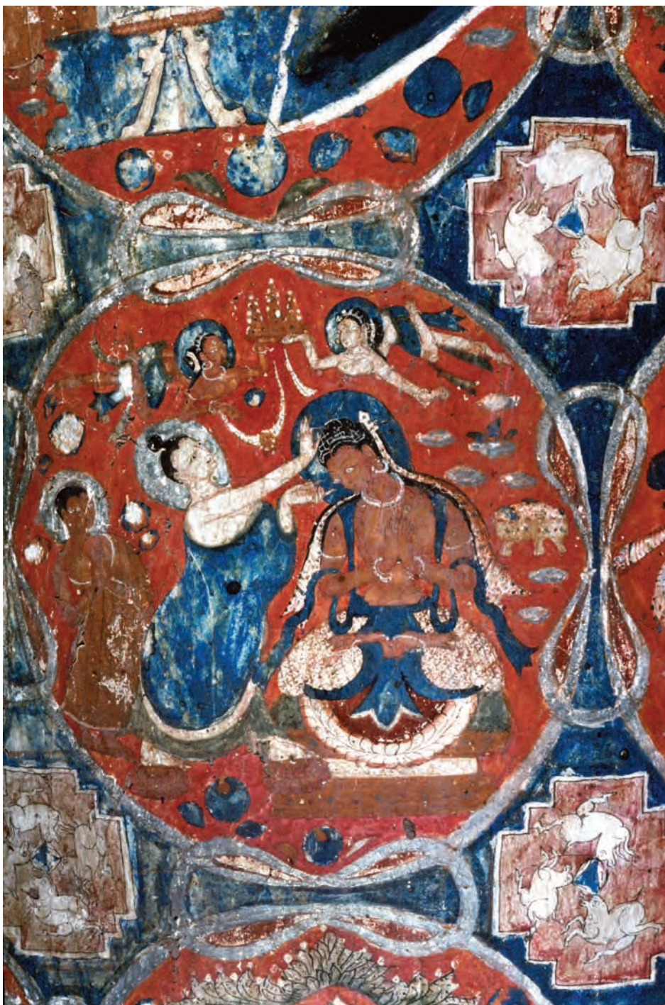
Detail of Maitreya's dhoti showing scenes of the Buddha's life. Sumtsek temple, Alchi

These Alchi 'Hares' are all linked with what looks like a prototype vajra which means both 'thunder bolt' and 'diamond' in Sanskrit and is called dorje in Tibetan. They may just be loops used to draw the design together in figure of eight, but early Buddhists, like early Christians, were fond of secret or obscure symbolism. If it looks like a vajra it may well be a vajra .